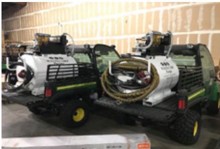
Mount in ATV (Select models only)