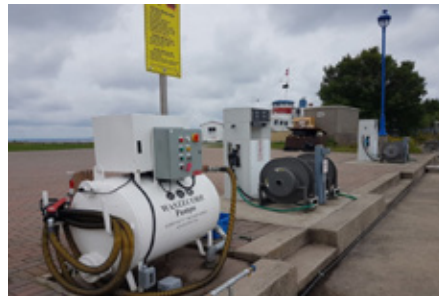
Mount on land, concrete or docks