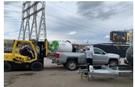
Slide-in Vacuum Systems for Trucks

Get superior high suction suction performance with the Super Duty TVP-300 Series. Designed for septic waste, grease trap pumping, wastewater transfer, construction sites, government applications, facilities management and site remediation services. Available in either stationary, slide in or trailer mounted units.