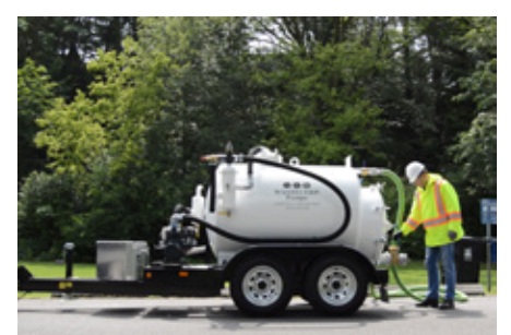
Designed for multiple applications