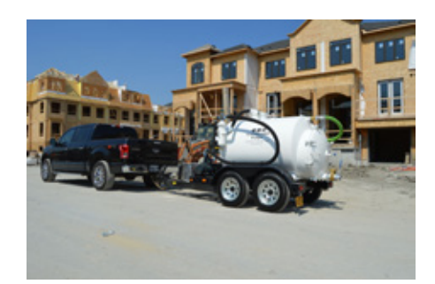
The ultimate in quality and dependability