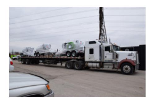
Ship to you or pick up at our factory