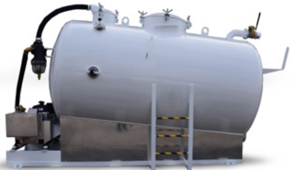
Tilt tank for pumping on uneven terrain, hills, slopes or mountainous regions.