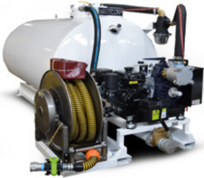
Front, rear or side mounted pump/engine system with hose reel and forklift pockets