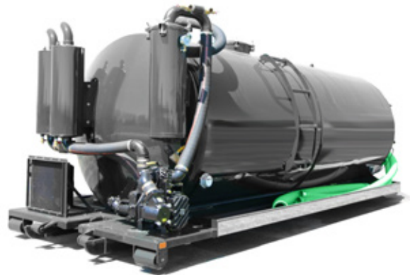
Roll-off skid system