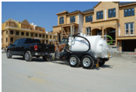
The ultimate in quality and dependability