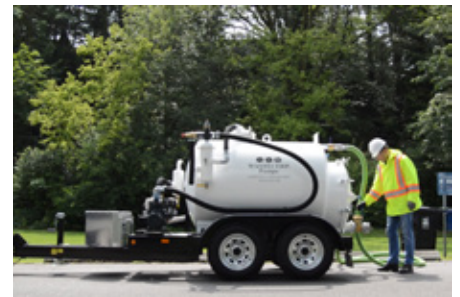
Designed for multiple applications