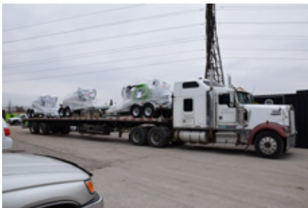
Ship to you or pick up at our factory