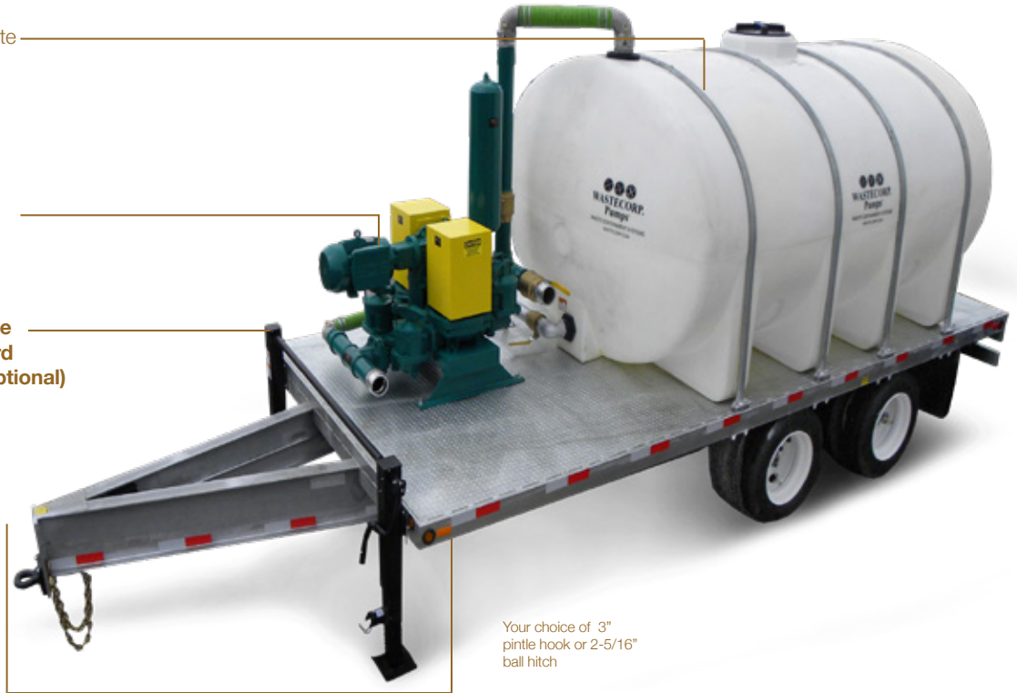
Your choice of 3" pintle hook or 2-5/16" ball hitch

DOT approved trailer package with LED lighting and electric brakes**