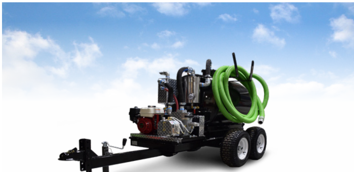
Optional configuration with accessories shown. Dual axle ATV vacuum pump trailer with Honda electric start engine)

Wastecorp is An ISO 9001 and ISO 14001 pump manufacturer